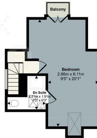
Second Floor Approx 26 sq m / 283 sq ft